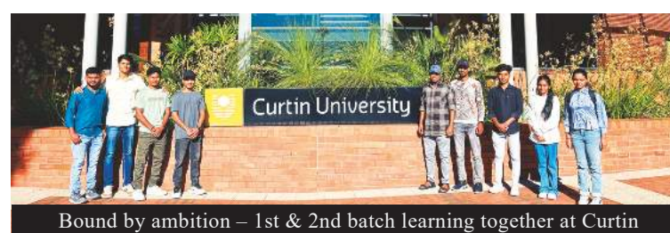
Bound by ambition – 1st & 2nd batch learning together at Curtin