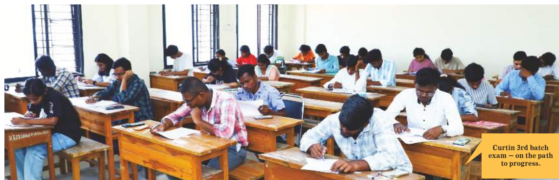
Curtin 3rd batch exam – on the path to progress.